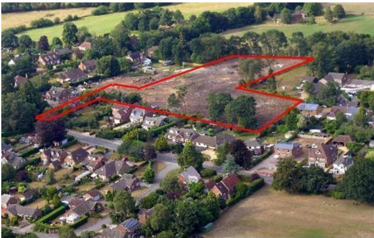
Aerial photo of application site with land to the west cleared prior to the construction of 5 dwellings now nearing completion.

The site lies outside but directly adjacent to the existing settlement boundary for Alderbury, as defined by the former Salisbury District Local Plan (adopted 2003) and carried forward and retained into the Wiltshire Core Strategy, which was adopted in January 2015. The Wiltshire Housing Site Allocations Plan 2020 (WHSAP) extended the settlement boundary for Alderbury up to the north western boundary of the site. This has the effect of the site being directly adjacent to the settlement boundary on three sides, rather than two when the previous application (19/03480/OUT) was determined.