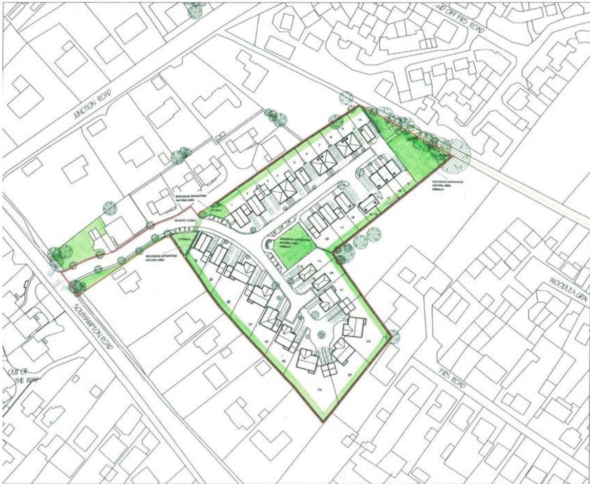
Indicative layout showing dwellings under construction to the west and the layout of the scheme granted on appeal to the north, which is nearing completion.